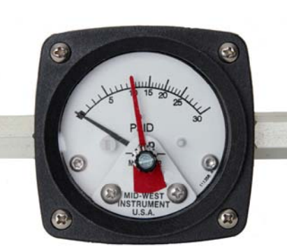
Model 122 0-30 PSID 2-1/2" Dial w/Maximum Follower Pointer