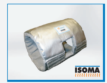
we get to the point...