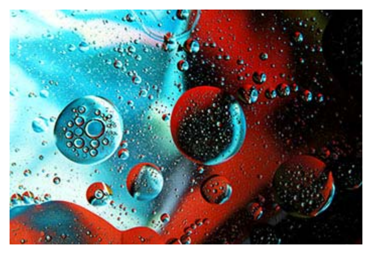
Free water in oil

The standard industrial EASZ-1 is an online instrument that accurately reports water content in any oil or fuel. One of the technical advantages is an inherent ability to detect the presence of moisture in ppm or free water as a percentage. This means that users can capture real time data on dissolved, emulsified and free water.