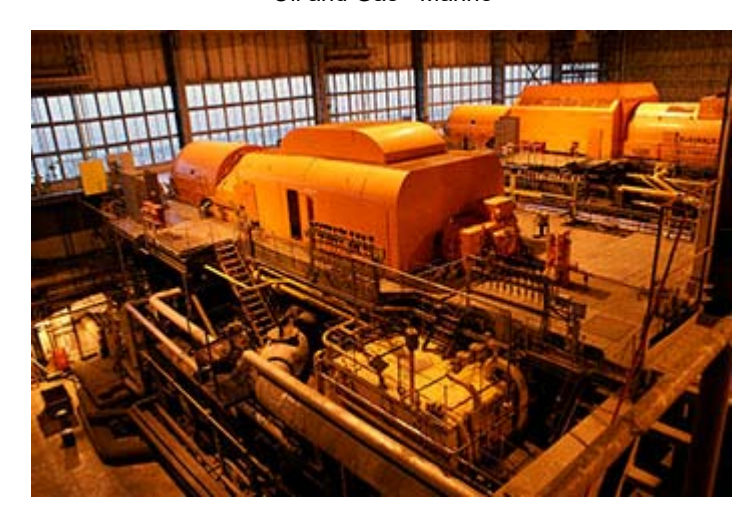
Power Plant - Power Production