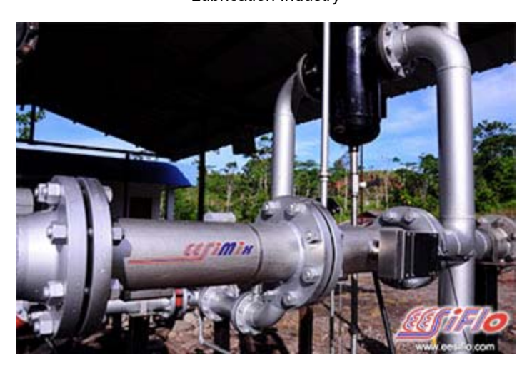
Crude Oil Export Metering Stations