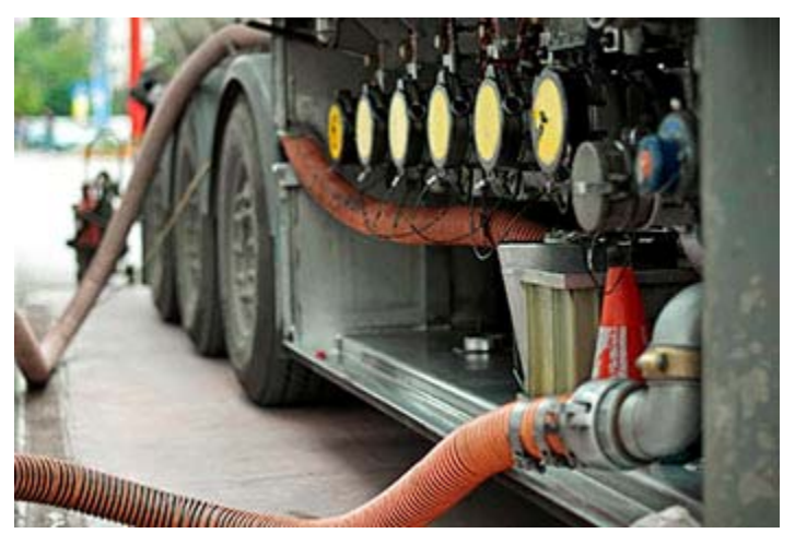
Tank Farms - Oil Terminals - Truck Unloading