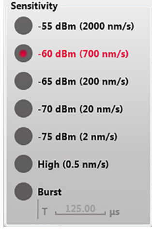
Figure 1. Sweep speed

The burst sensitivity is adapted to burst signals and dedicated to GPON measurements. The duty cycle must be in the range 2-100% with a period between 124 and 2001 µs.