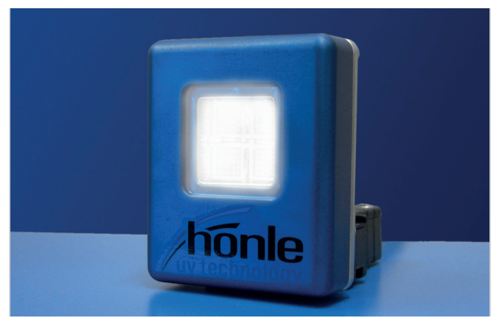
LED Spot W

The LED Spot allows for a very flexible use due to its high intensity and the possibility to control the LEDs in a cycle time <100 \mu s externaly. Thus, it is possible to realize shortest cycle and machine throughput times , especially in fully automated production lines.