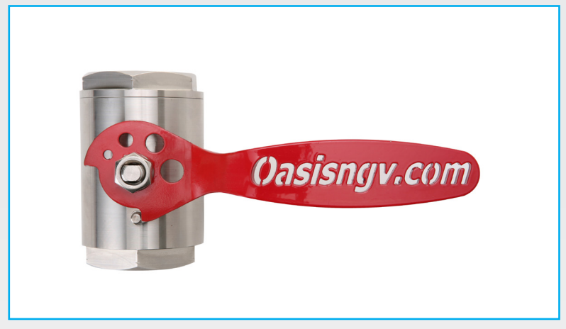
BV708-4N6LDDN-1000 - 1" Ball Valve

Suitable for use with CNG, Helium, Bio-Gas, Nitrogen, Air and other gases on enquiry.