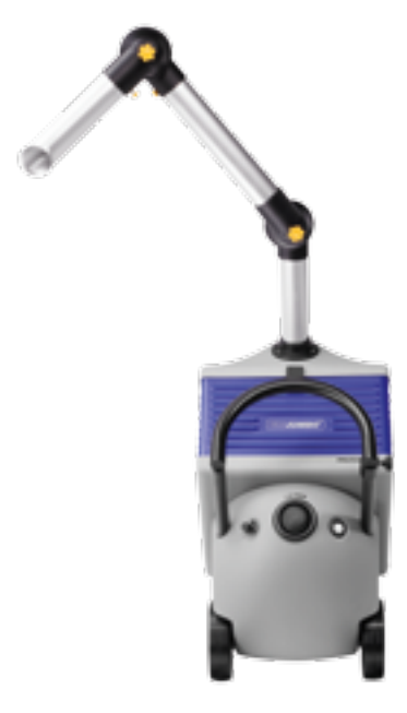
Easy operation with filter saturation indicator and stepless control of volume flow rate.