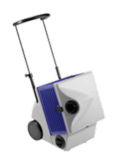
Mobile roll position on the floor with extended telescopic handle and side mounted intake socket.