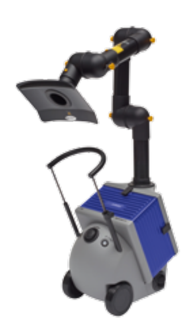
To adapt the unit to various applications and work place environments, users can supply it with different collecting elements of varying material and size.