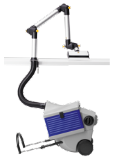
The unit is lying under the bench, also featuring a hose connection to the extraction arm. The extended telescopic handle may serve as an additional adjusting device.