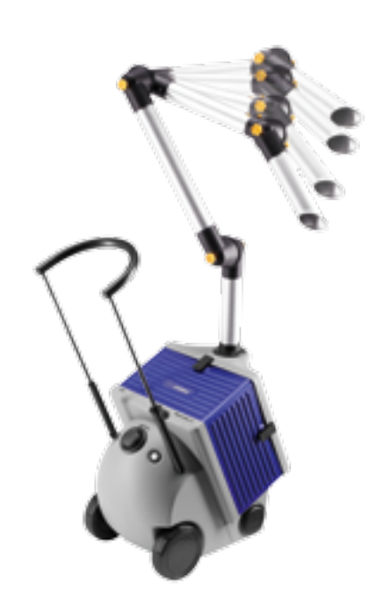
For on-the-spot extraction, the extraction arm can be precisely adjusted.