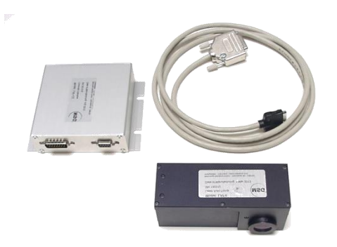
LAF5-CH HYBRID sensor & LAF-C3 stepper/ servo drive controller with 2 channel high power isolated LED supplies