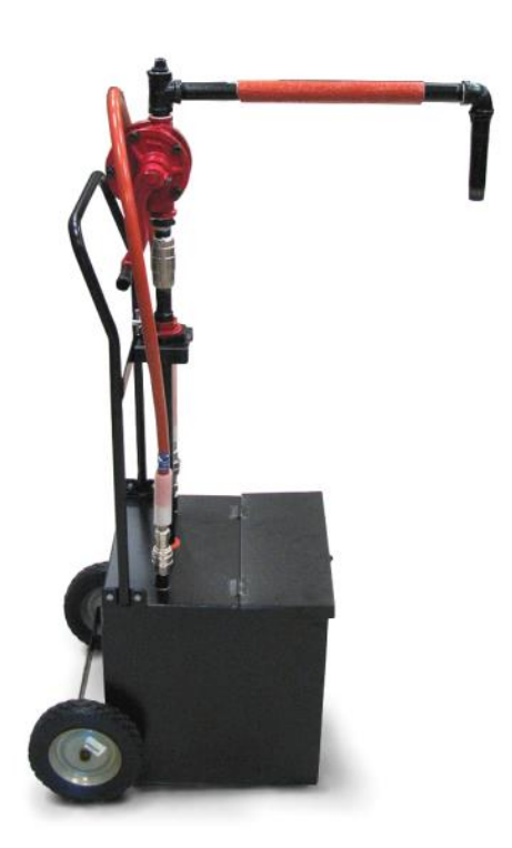
ODS 100 fryer oil disposal system

The unappealing job of draining, transporting and disposing of spent frying oil becomes much easier with the Henny Penny ODS 100.