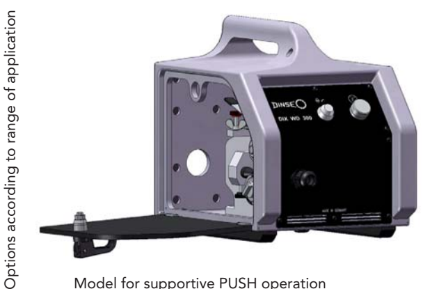
Model for supportive PUSH operation