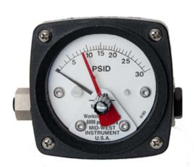
Model 120 0-30 PSID With Maximum Follower Pointer