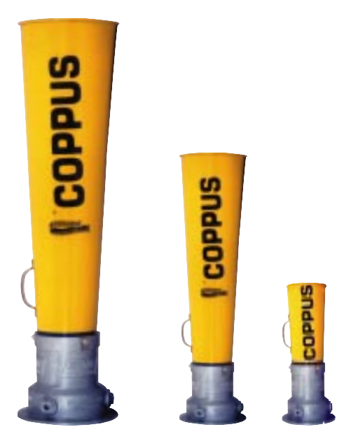
NOTE: Maximum operatiing pressure is 150 PSIG