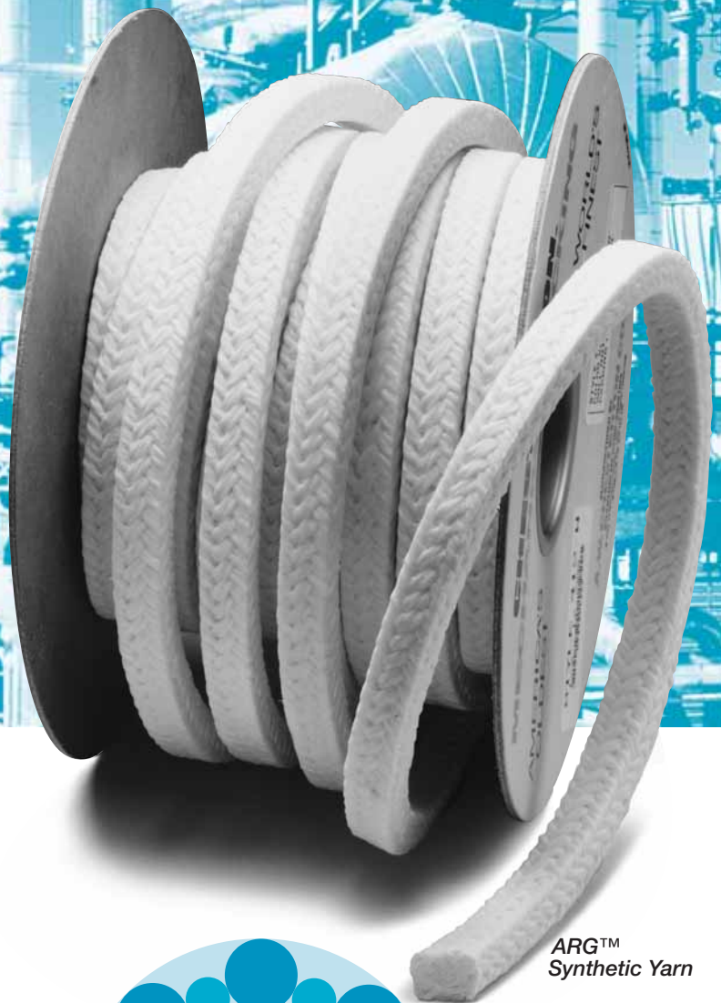
ARG™ Synthetic Yarn

CHESTERTON® 412-W is designed for shafts and rods against water, oil, steam, solvents, and mild acids and alkalis to 450°F (250°C) and shaft speed to 2,000 ft/min (10 m/sec), pH 4 –10.