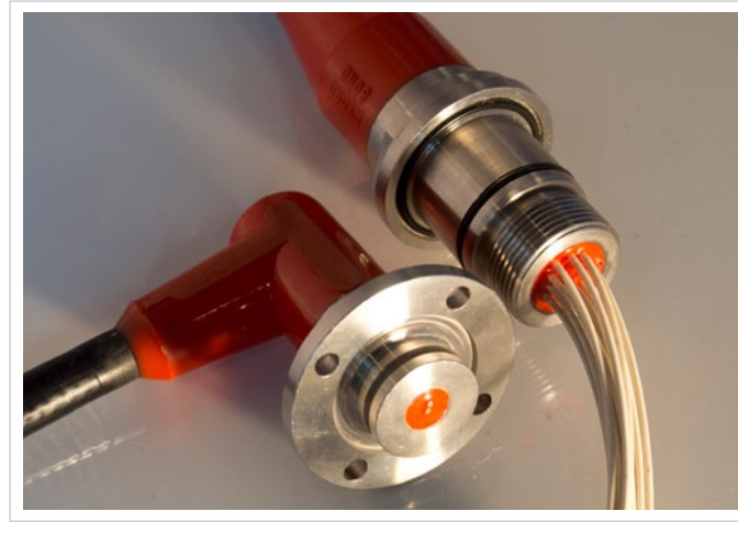
HPS: (Unmanned Electrical Penetrator)

Our Electrical Engineers and Technicians are fully trained and certified on our equipment by City & Guilds.