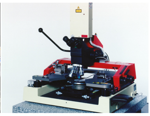
MEMS testing on PM8 with pressure chuck.