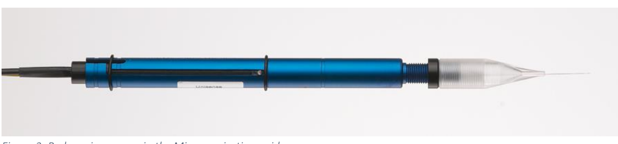
Figure 3: Redox microsensor in the Microrespiration guide.