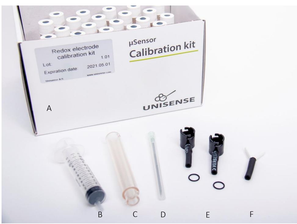
Figure 1: Calibration kit contents: A: Calibration kit box with Exetainers, B: 10 ml syringe, C: 10 cm tube for reference electrode, D: 80 x 2.1 mm needle (green), E: two Calibration Caps with tubing and O-rings, F: Y-connector with tubing.