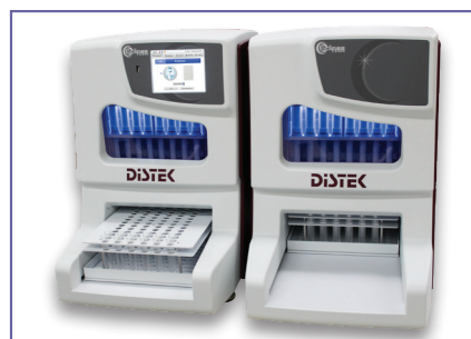
Dual Bath Parent / Child Configuration