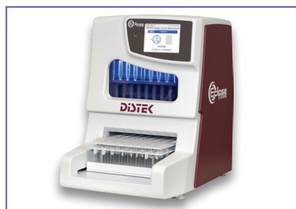
Eclipse 5300 without Filter Changer