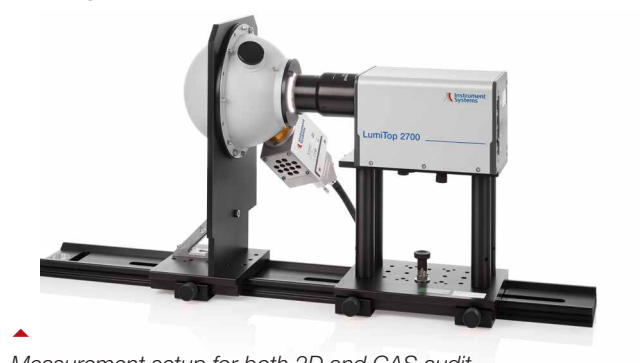
Measurement setup for both 2D and CAS audit.

The image sensor calibration of luminance and color measurement cameras (2D audit) and the measurement accuracy of photometric measuring devices (CAS audit, ACS 150 only) are tested in the same measurement setup: at a distance of 2 mm from the camera objective lens housing.