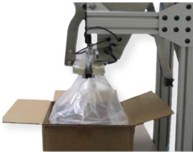
Full Vertical Position Machine Stand