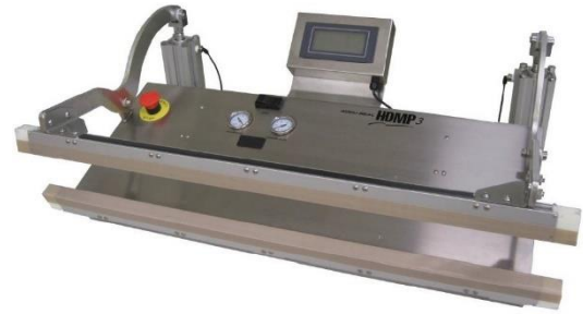
Large Body HDMP3-SO