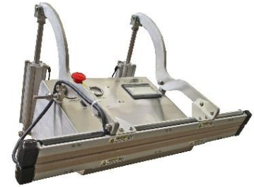
Small Body HDMP3-SO

Built to handle the big jobs and the toughest materials in seal lengths up to 60" for virtually any product packaging.