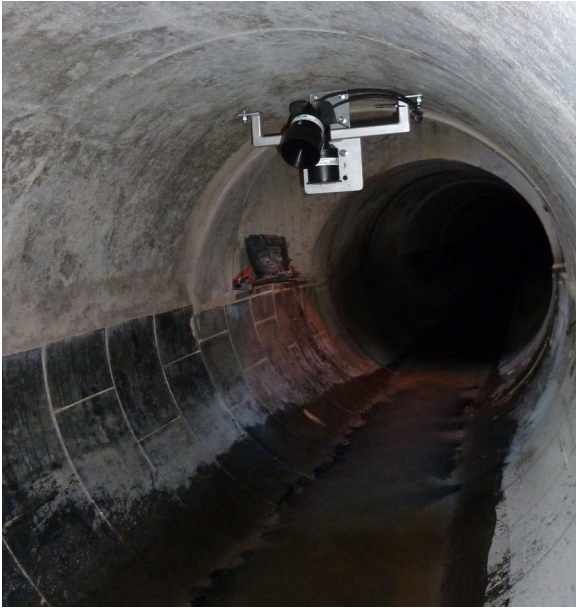
MicroFlow-i Measuring Flow Velocity

Management of pollution under flood conditions is a significant challenge and, with ever more demanding monitoring regimes, operators have implemented thousands of CSO monitoring installations and thousands more are planned, with data logging and level measurement to record spill events. Looking beyond CSO, there are good reasons to monitor flow throughout the wastewater network to identify problem areas, alert maintenance teams, and generate corrective action.