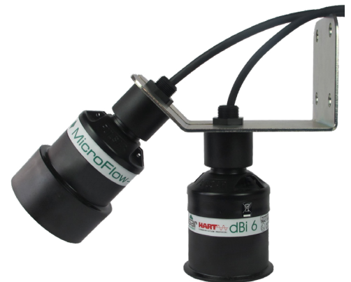
The MicroFlow-i and dBi low powered sensors for CSO Network Monitoring.

For more information on our service offerings, please visit the website or contact one of our head offices.