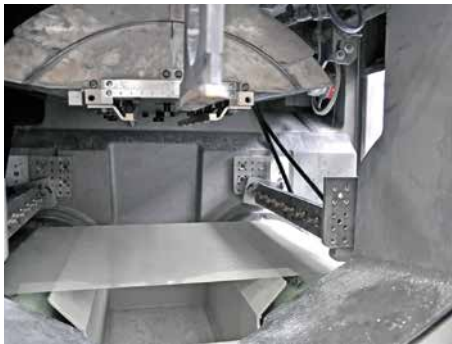
Variety of options for more flexibility