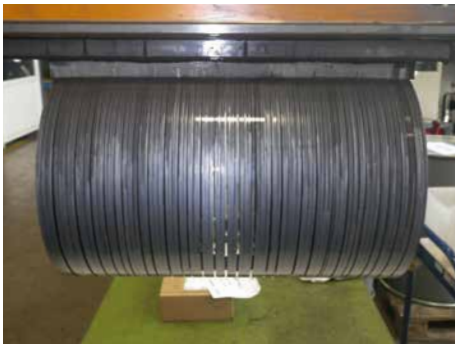
Long load length for more output