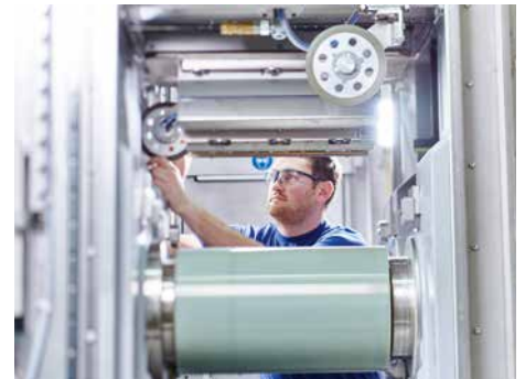
Easy accessibility for higher uptime