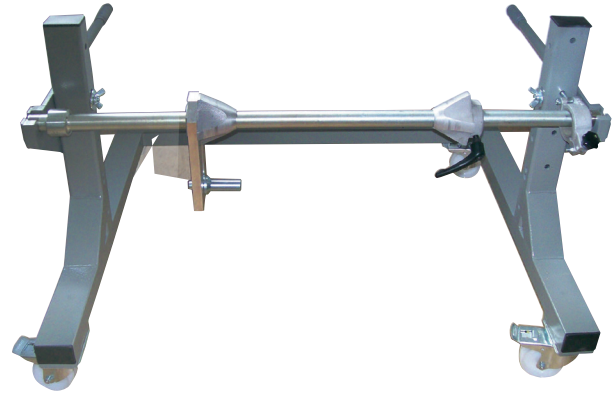
Fig. 2 TROMTRAK 1250 incl. adjustable driving pin