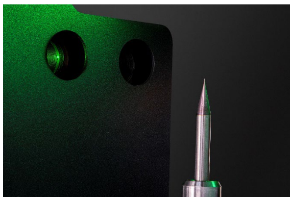
Brilliant surface display Example tool with \emptyset = 0,2 mm