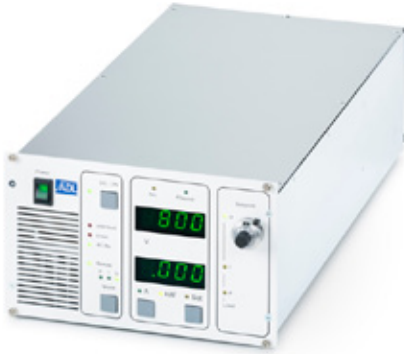
GS with active front panel