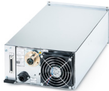
Rear view GS 15/20/30 with coax plug

These compact power supplies were developed for small magnetrons in production plants and laboratories. Easy and safe operation make these power supplies very flexible for many processes. The arc handling adjusts automatically to different process parameters, so that programming is unnecessary. The air cooled units are designed for manual and remote-controlled operation, for installation in 19"-racks.