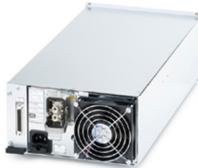
Rear view GS 05 / GS 10 / GS 12 with Harting plug