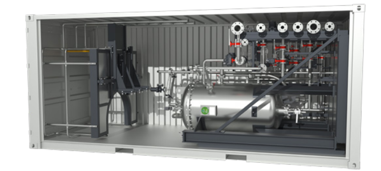
Quick and easy transport: filters can be packed and transported in standard sea containers.