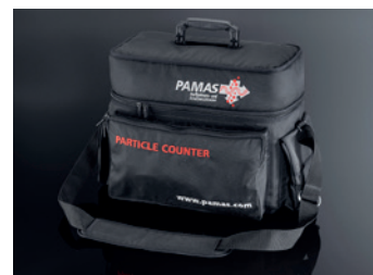
Shoulder bag PAMAS GO

The custom-fit shoulder bag provides extra space for accessories.