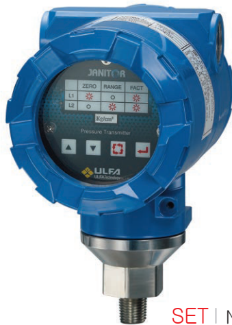
SET | NON DISPLAY 4~20mA(2-WIRE)

SET Series 압력계는 액체 또는 호환성 기체의 압력을 정밀하게( \pm 0.25\% ) 측정하여 전류(4~20mA)를 출력한다.