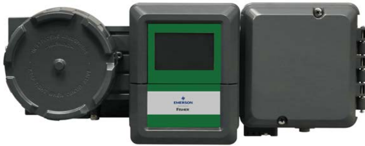
Figure 1. Fisher DPC2K Digital Process Controller