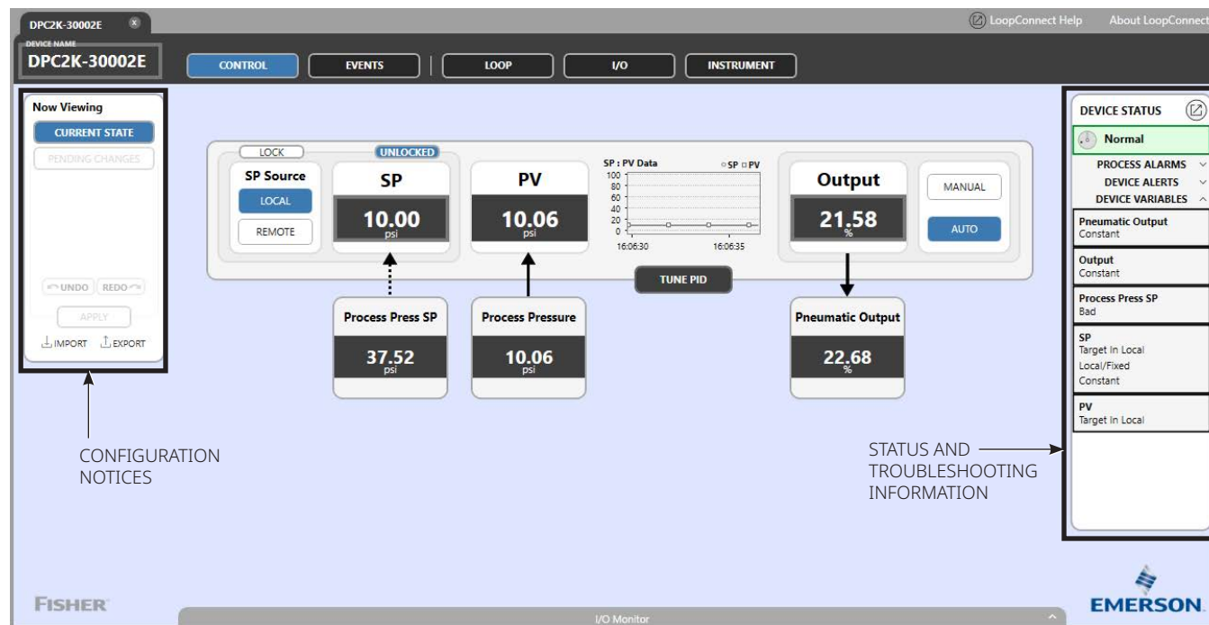
Figure 3. LoopConnect CONTROL Dashboard

The software features five dashboards: Control (main dashboard, see Figure 3), Events, Loop, I/O, and Instrument. The Control and Event dashboards are used for operation. The Loop, I/O, and Instrument dashboards are used for configuration.