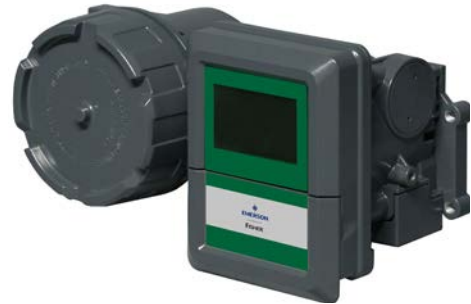
BASE UNIT WITH PNEUMATIC OUTPUT OPTION