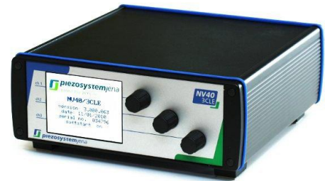
Image: NV 40/3 CLE

Various control interfaces are available. There is an analog interface, that can be controlled by 0 to 10 V, RS 232, and USB 2.0 interface. The digital interfaces have a resolution of 16 bit. An analog monitor output shows the control voltage of the piezoelectric actuator in a fixed ratio, completing the technical advantages of the series NV 40/3 and NV 40/3CLE.